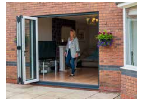
The Imagine Bi-Fold Door makes an attractive alternative to a traditional sliding patio door; completely opening your home up to the garden or patio.